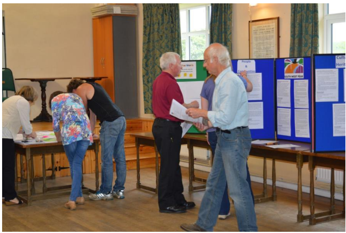
Figure 6. People taking part at the Warslow roadshow