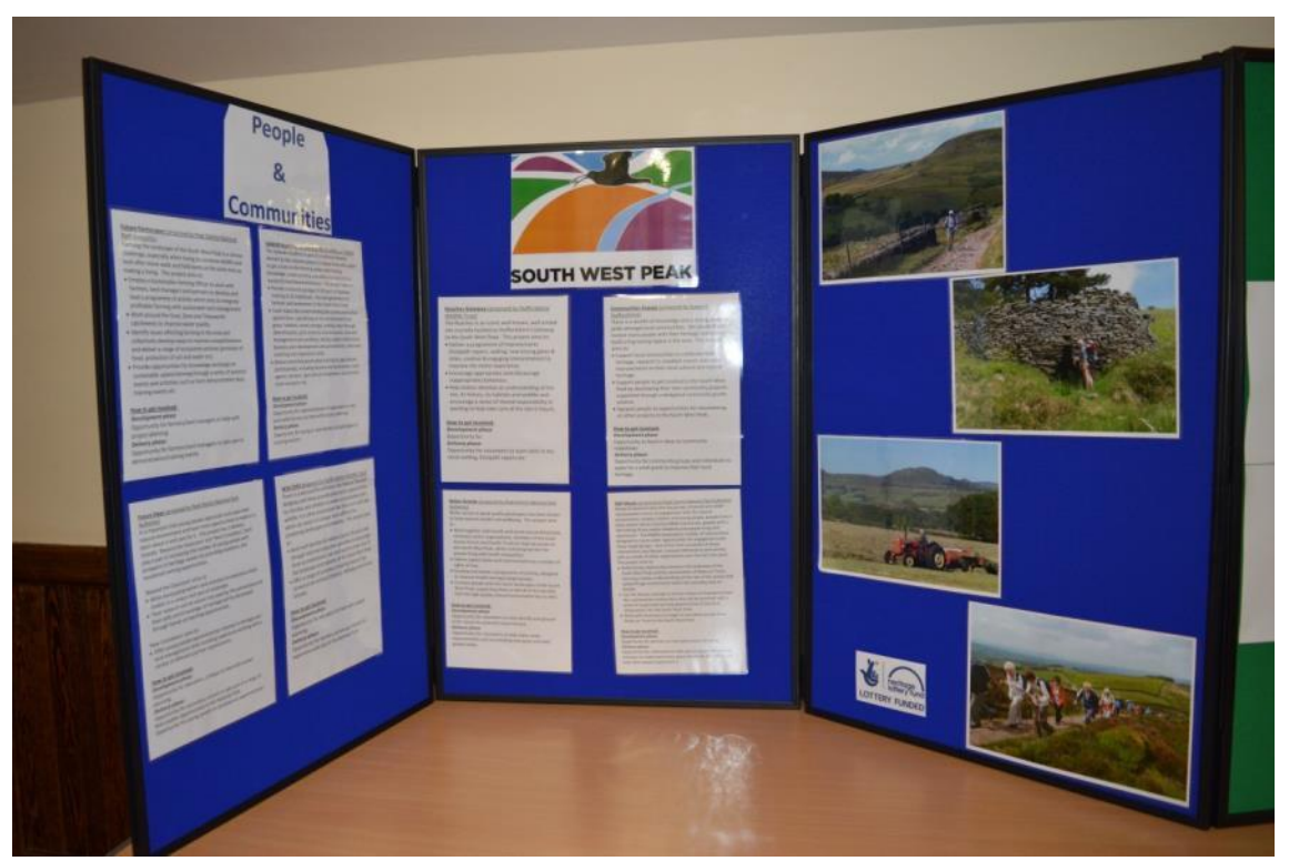
Figure 3. People & Communities projects display