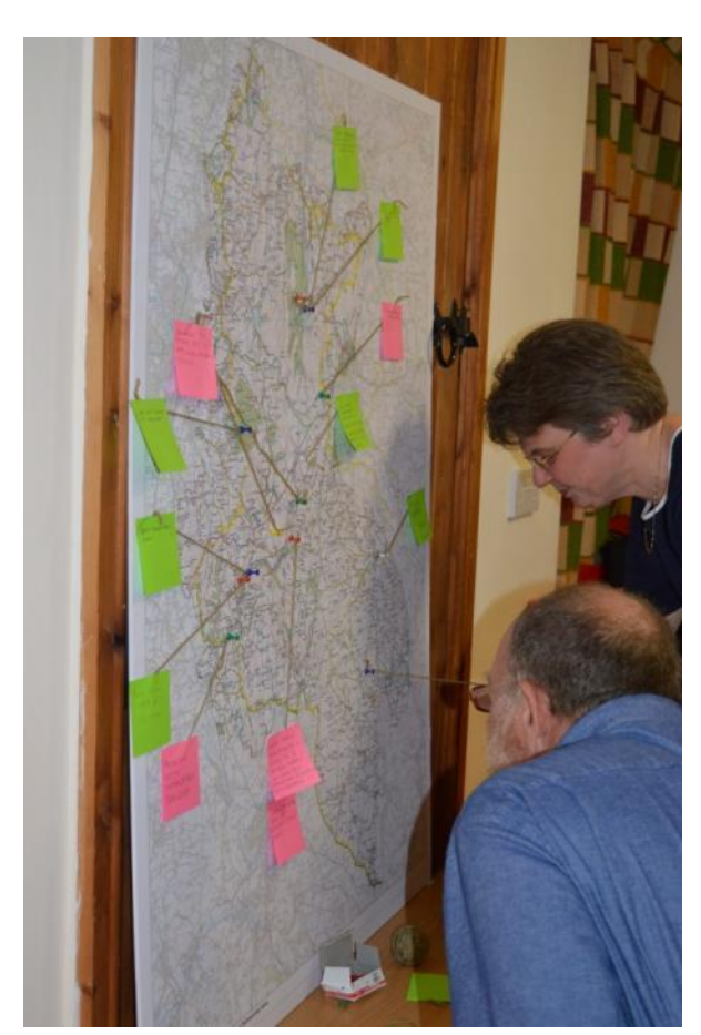
Figure 4. The map exercise at Wildboarclough