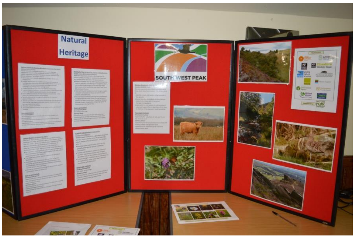
Figure 2. Natural Heritage projects display