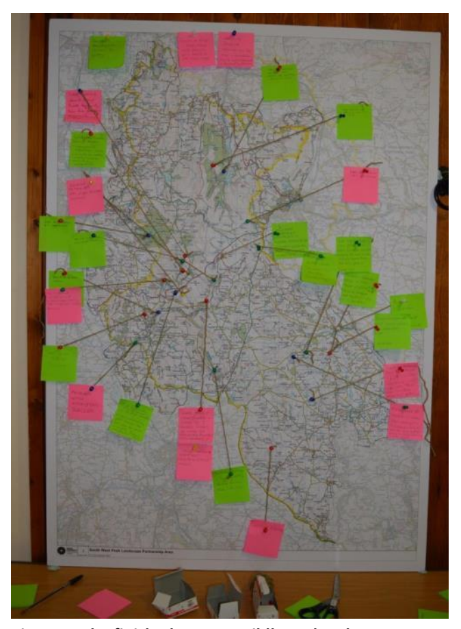
Figure 5. The finished map at Wildboarclough