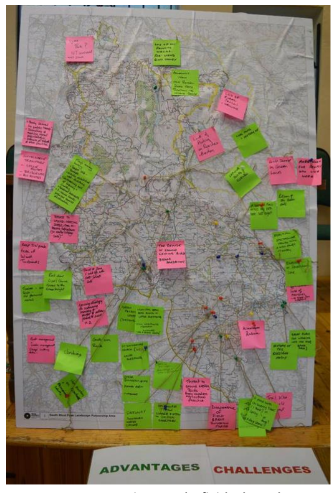
Figure 8. The finished Warslow map