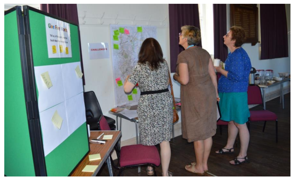
Figure 9. Participants at the Kettleshulme roadshow