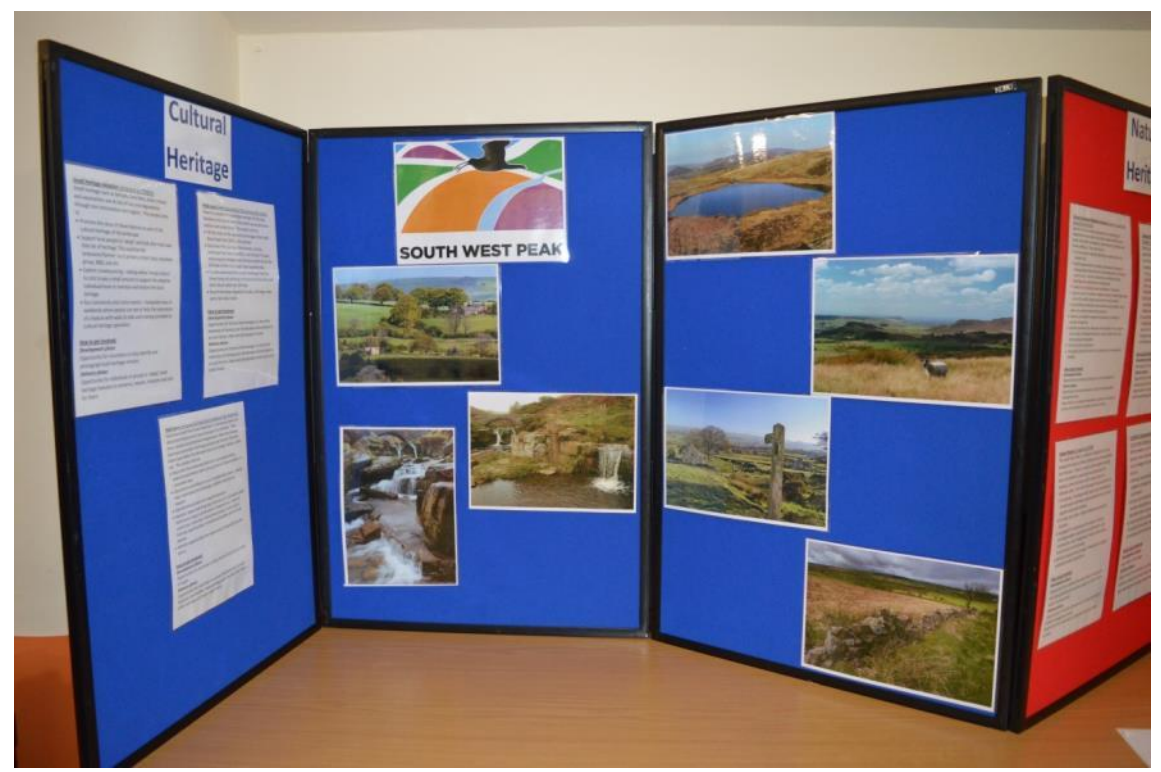
Figure 1. Cultural Heritage projects display