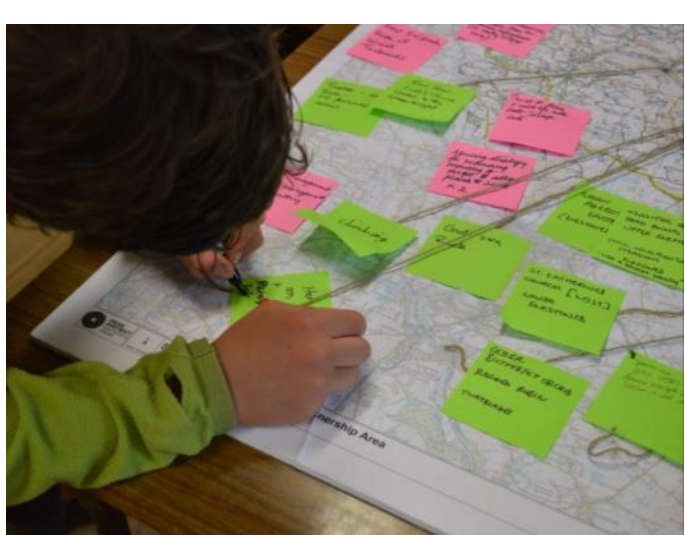
Figure 7. Enjoying the map exercise